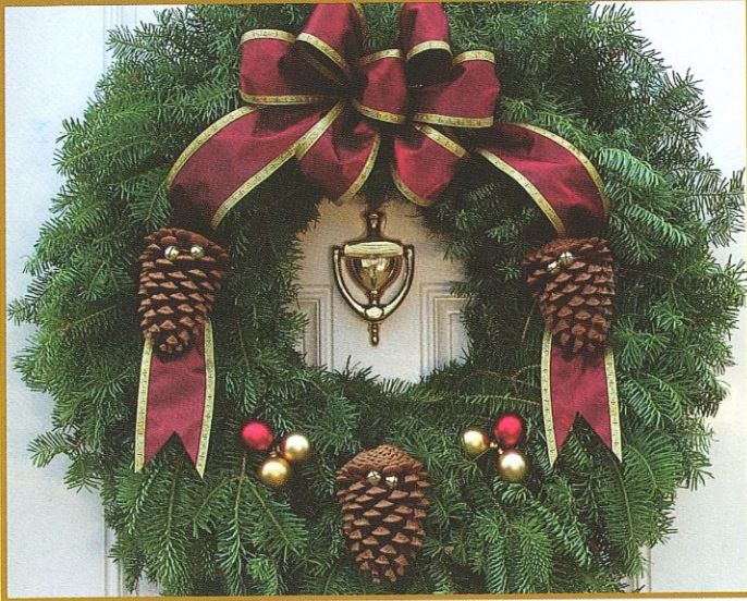
25" VICTORIAN WREATH