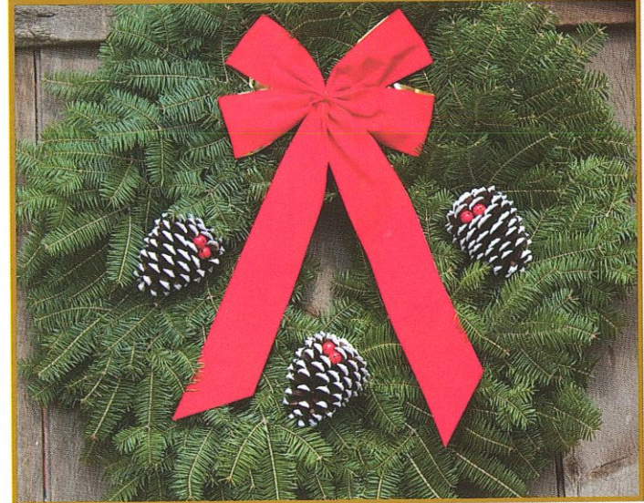
25" CLASSIC WREATH